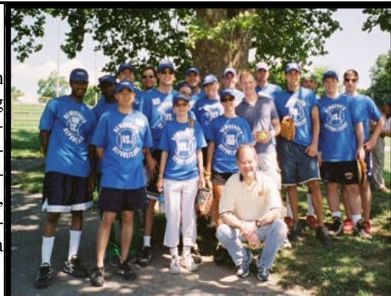
DCYDs pose with Congressman Jim Cooper